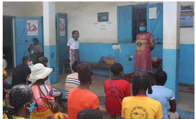
CSB staff in Ampasy Nahmpoana and Mandromoromotra receive information on food distribution in March 2021