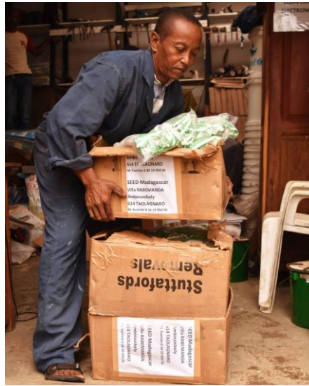
Unpacking the first shipment of ready-to-use therapeutic food

To raise awareness of malnutrition screening and treatment, two days of mass mobilisation will take place in each village. The process of screening and diagnosis will take five days, according to national guidelines. ACs have begun malnutrition screening in Manambaro and Soanierana, and children diagnosed with malnutrition will visit the local CSB for confirmation of diagnosis. Children identified as suffering from SAM with further health complications will be provided transportation to a medical facility in Fort Dauphin where they will receive emergency medical treatment. After data from the CSBs are entered in the Ministry of Health software, food distribution preparations will begin, with the first round of food distribution scheduled to commence on March 22nd. Manambaro and Soanierana will be used as a pilot to capture numbers of MAM and SAM, which will help guide our initial distribution targets for the first round of food distribution in the seven sites. Unprepared food, including rice, beans, and oil, for families of children undergoing treatment will be purchased after screening and diagnosis.