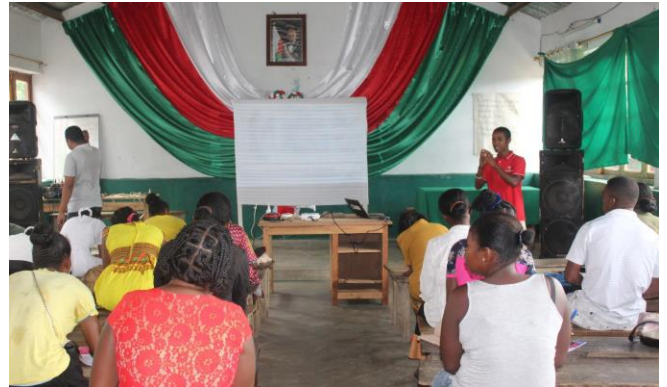
The training of CSB staff in Ampasy Nahmpoana and Mandromoromotra to identify children with malnutrition in March 2021