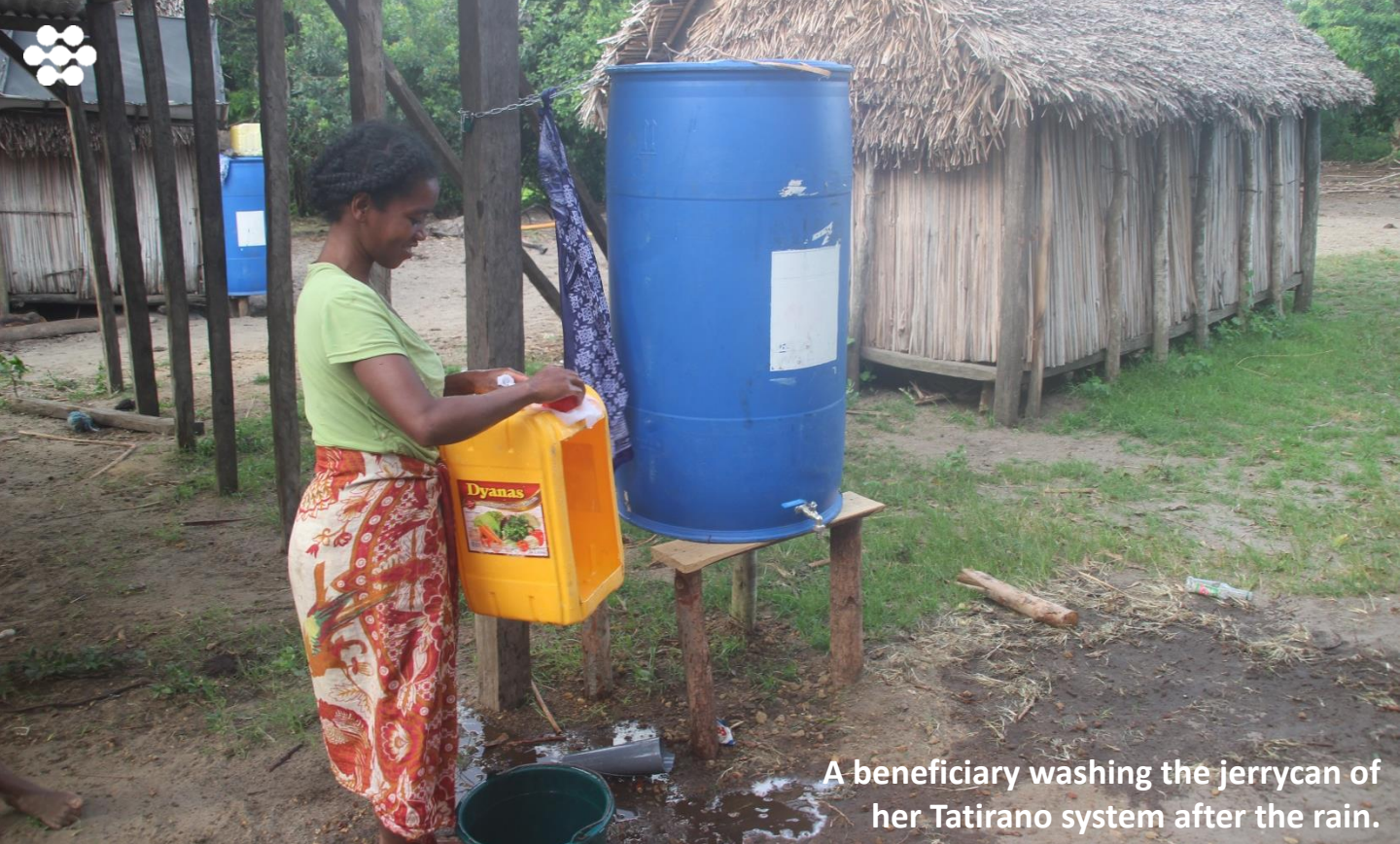
A beneficiary washing the jerrycan of her Tatirano system after the rain.